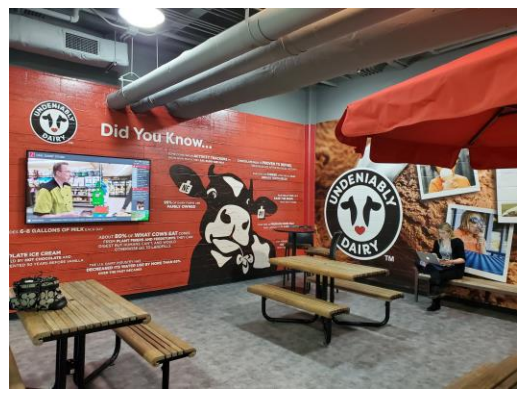
Undeniably Dairy messaging on display at the University of Nebraska-Lincoln Dairy Store.

Midwest Dairy partnered with the University of Nebraska-Lincoln (UNL) Dairy Store to bring the Undeniably Dairy campaign and messaging to the 100,000 visitors and guests it hosts each year. The display includes an Undeniably Dairy selfie wall, a panel with "Did You Know" facts and includes a television which showcases Nebraska dairy farmer profiles and content to help connect consumers to the farm.