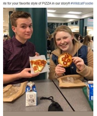
Students from Millard Public Schools enjoy pizza made with ovens funded by Midwest Dairy.

Millard Public Schools Food Service Department January 31 at 1:05 PM · @