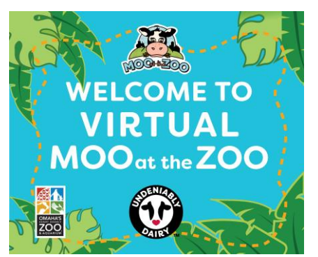
A colorful graphic welcomes visitors to the virtual Moo at the Zoo experience

Moo at the Zoo is a long-standing Nebraska tradition, bringing together consumers, cows and dairy farmers at Omaha's Henry Doorly Zoo and Aquarium to kick off and celebrate National Dairy Month. In June 2020, due to COVID-19, the zoo was closed to visitors; however, the popularity and excitement for Moo at the Zoo presented an opportunity to think differently about how the experience could come to life for consumers. Midwest Dairy, in partnership with the zoo, executed a virtual experience to engage consumers in dairy's story.