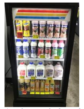
A cooler near the front of the store makes grabbing dairy easy for B&R shoppers

Midwest Dairy has partnered with B&R Stores, a grocery chain with 20 stores in Nebraska under the banners of Russ's, Super Saver and Apple Markets, on a pilot project to add secondary grab 'n go coolers to three stores in order to increase milk sales near the front end of the store. Each cooler contains grab 'n go single serve milk as well as commonly-purchased quart size milk to make it easy for shoppers to add more dairy to their cart. The secondary cooler pilot began in August of 2019. Initial sales results of these items, with just three coolers in place for only 30 days, delivered a unit sales increase of 28% over prior month sales. In February 2020, sales data showed a unit growth of 49% in chocolate quarts, 15% in white quarts and 23% in strawberry single serves. March 2020 total dollar sales for dairy items was up 17%, and total units sold was up 4% from March 2019. In addition to these initial positive sales results, Midwest Dairy has also built a relationship with the organization's social media manager and has provided dairy-specific social media content throughout the year for B&R stores to share on their social media channels to engage with shoppers.