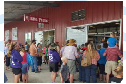
Crowds gathered to watch milking demonstrations throughout the fair.

Midwest Dairy continued to sponsor the Milking Parlor, with milking demonstrations five times a day throughout the fair. Nebraska State Fair attendance reached record levels in its sixth year at the new facilities in Grand Island.