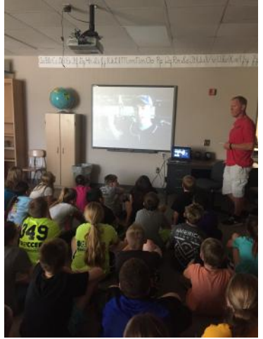
Students watch live as a dairy farmer shows them around the farm.

With an eye toward reaching classrooms who aren't able to visit a farm personally, Midwest Dairy piloted a successful virtual dairy farm tour with two Nebraska dairies and corresponding schools. Using the Internet application Zoom and some iPads, 75 kindergarten students in Lincoln viewed Classic Dairy in Jansen, while 80 fifth-graders in Papillion saw the sites at Prairieland Dairy in Firth. Glimpses of feed, calves, the milking parlor and the free-stall barn were viewed by students and they even rode (virtually) on a cart pulled behind a four-wheeler, exclaiming "wee, wee!" while doing so. Pre-selected students asked the dairy farmers questions by standing in front of the camera in the classroom.